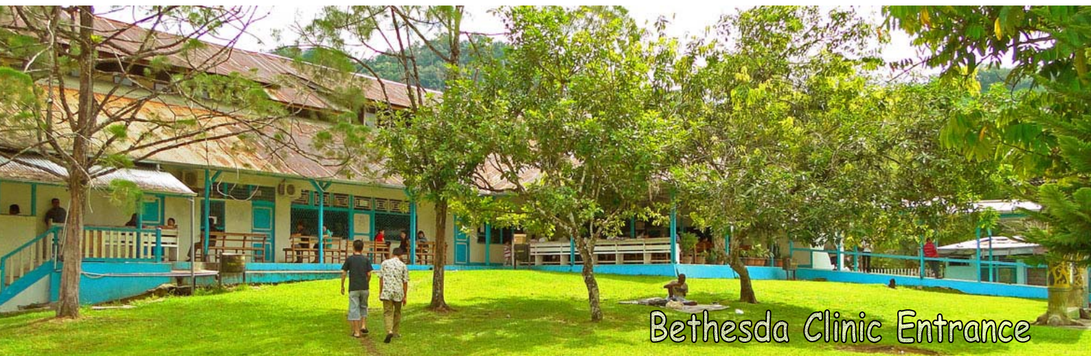
Bethesda Clinic Entrance

I will be here till May, so hopefully I can do all the things on the list I have gotten with urgent things that needs to be fixed and built. From water pipes and tanks, electricity, steam for sterilization, incl all kinds of medical equipment and machines.